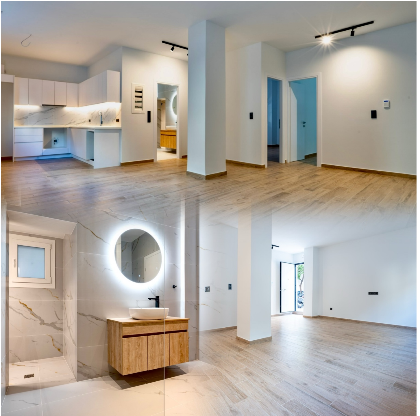
This image shows the style and quality of typical finishes used in similar projects.